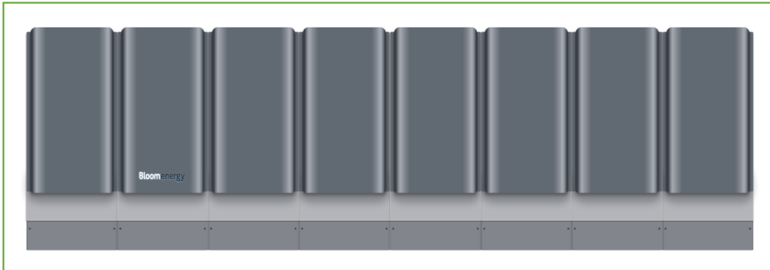
Figure 1- Bloom Energy Server

micro-grid projects that are designed to operate indefinitely in the event of an outage of the electric grid.